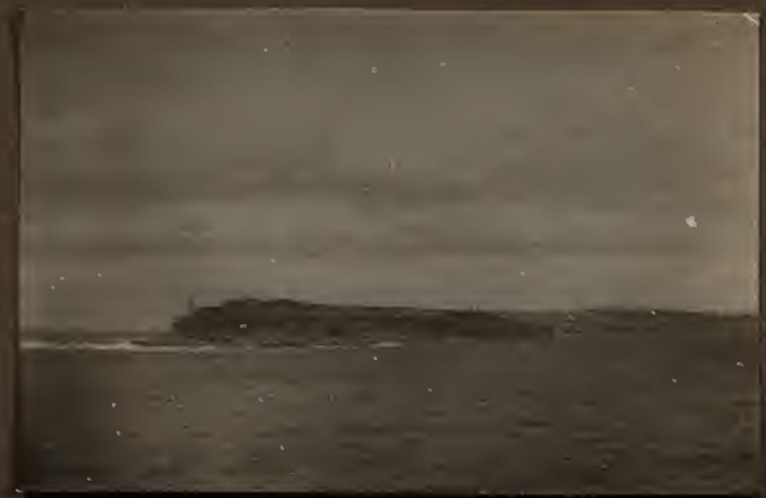
Sydney Heads 5 vi 28